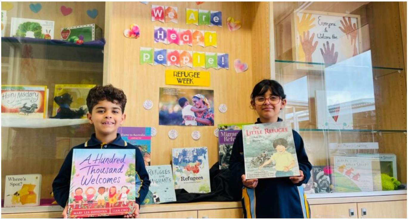
The Southern Cross newsletter and the online edition of The Southern Cross August 2024.