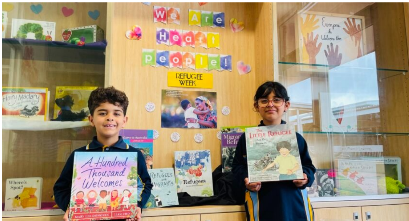
The Southern Cross newsletter and the online edition of The Southern Cross August 2024.