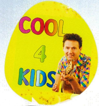
COOL 4 KIDS