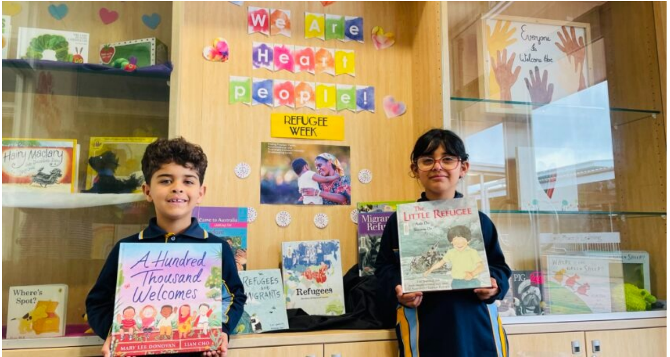
The Southern Cross newsletter and the online edition of The Southern Cross September 2024